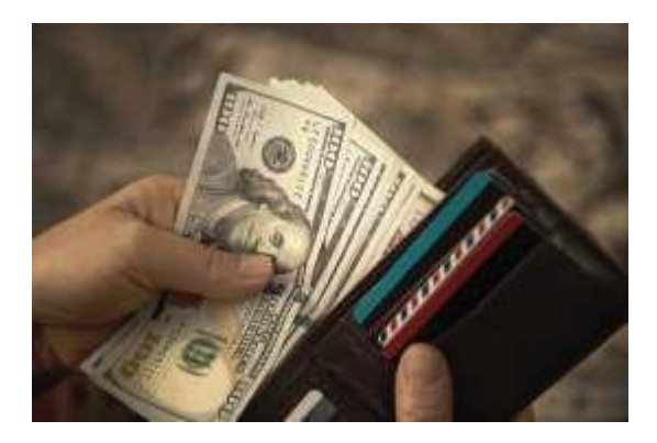
Schedule of Benefits